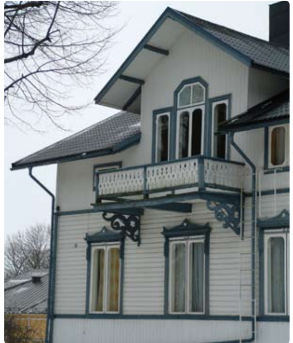
Buildings in the old Mariehamn in Jugendsali.