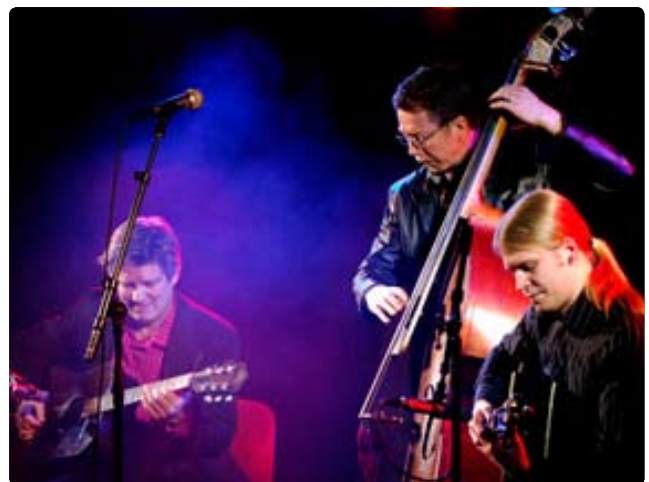
Whatclub (of Mariehamn) On stage Thursday 14. June at 14.45