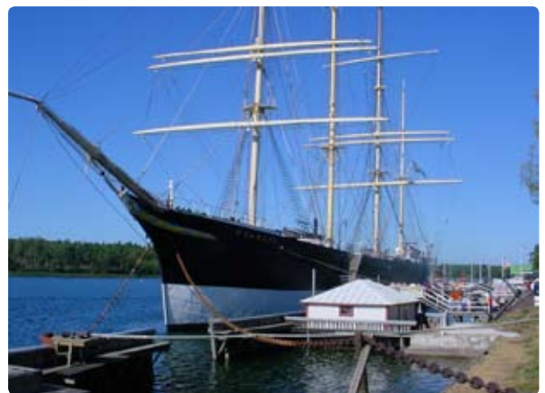
Museum ship Pommern - in National library of Finland.